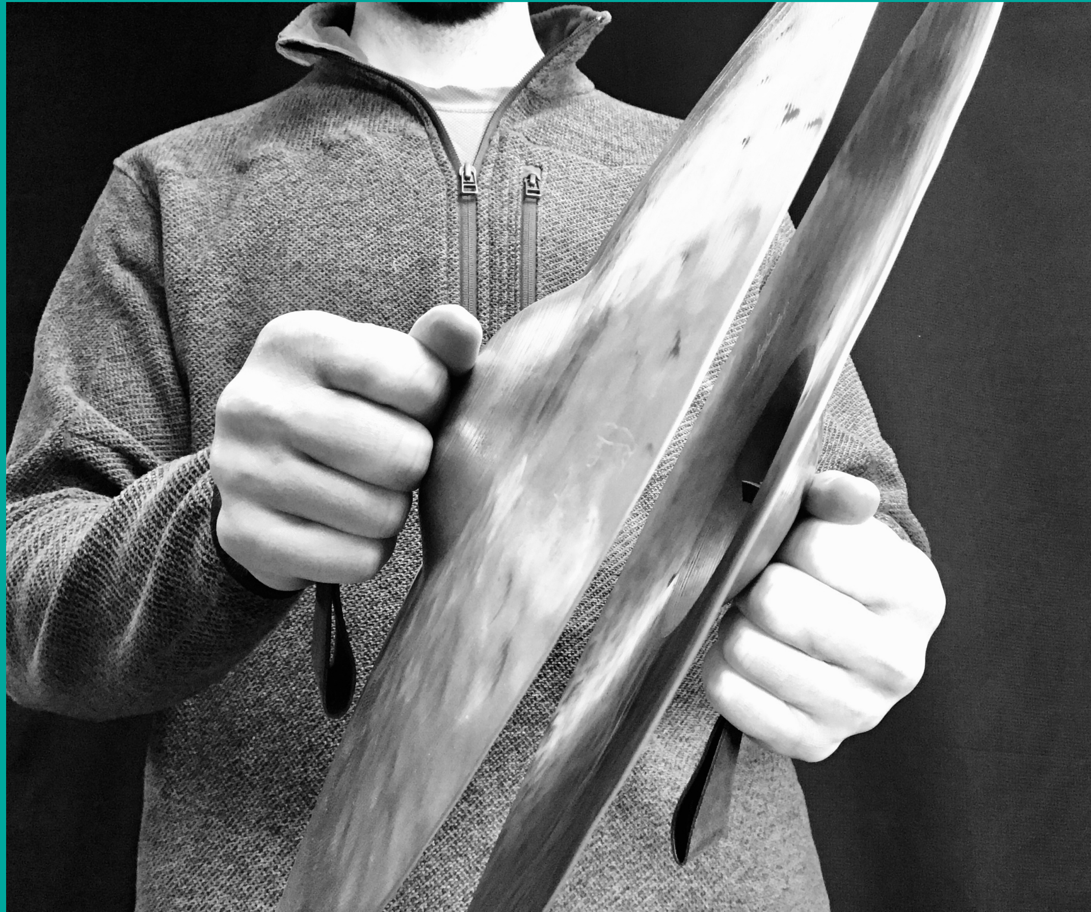
45° Hand-held Position